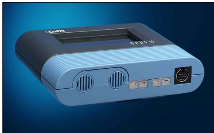
Opus 10 Shown with Two Standard Thermocouple Inputs and RS232 Port

The Opus 10 is now available for gathering two Temperatures using Thermocouples. It accepts Type K, J, E, R, S, and T Thermocouples, thus providing for a wide variety of measuring ranges. Includes RS232 Interface Port for Windows™ compatible SmartGraph™ 2 Software provided. For use in environmental applications.