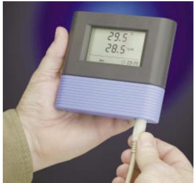
OPUS 10 Internal Sensors (Model 8152.00) shown with RS232 cable for Windows™ Compatible SmartGraph™ Computer Interface. (Model No. 8152.10 features external sensors).